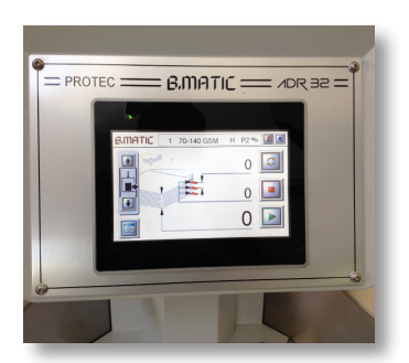
WIDE TOUCH SCREEN HD 7"