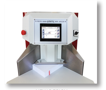
NEW DESIGN WITH POWERFUL CLAMP

Protec ADR 32 Light model 40-300 GSM / Protec ADR 32 Hard model 200-800 GSM / Protec ADR 32 Wide model 40-800