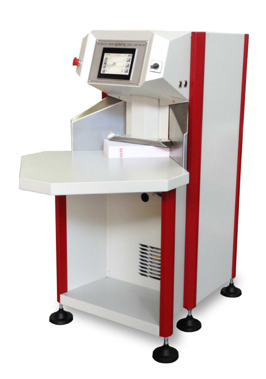
ADR 32 COUNTING HEAD AT 3000 SHEETS/MIN