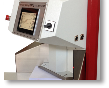
USB AND ETHERNET INTERFACE